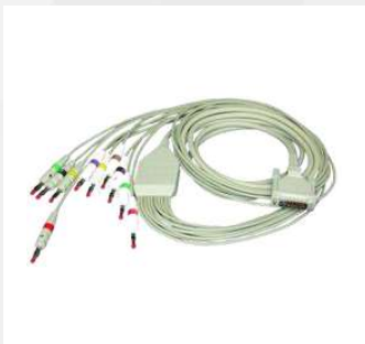
RECORDER PATIENT CABLE*